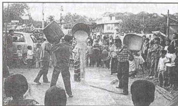
Farmers of Chieruphi Village, Jaintia Hills presenting a cultural item during NLRCW