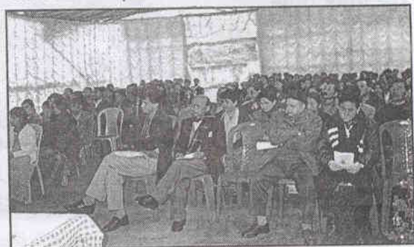
Pre-Christmas Service held at Shillong.