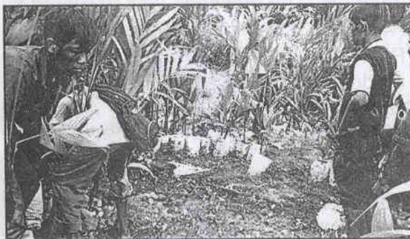
Farmers carrying the seedlings from Nonglait Nursery, East Khasi Hills.

Another seedling distribution was organized at Nonglait Nursery, which was created during the year 2001-2002 in which 35,123 nos of Arecanut and Citrus seedlings were distributed to 100 nos of farmers.