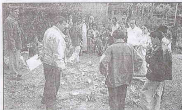
Participatory Mapping exercises at Umrynjah village (WDPSCA), East Khasi Hills.