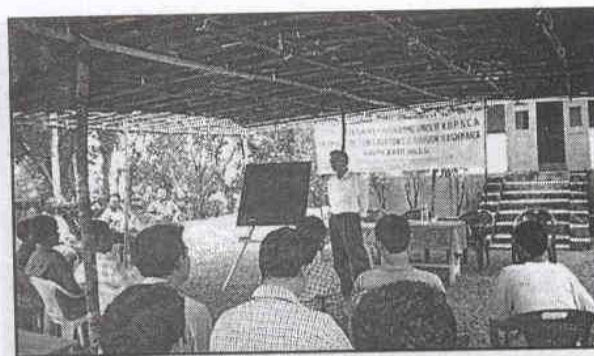
Training Programme for Watershed Committee members at Ampanggre village.

The office of the Divisional Soil Conservation Officer, Baghmara Soil Conservation Cash Crop Division, South Garo Hills, organized Training Programme for the members of Rompa Bisik, Rongme, Rongmai and Adap Chiring Watershed Committees at Ampanggre Village. The participants were apprised of the role and importance of watershed management by the officers drawn from social Forestry, Animal Husbandry & Veterinary, Horticulture and Fishery Departments including officials from the Soil and Water Conservation Department.