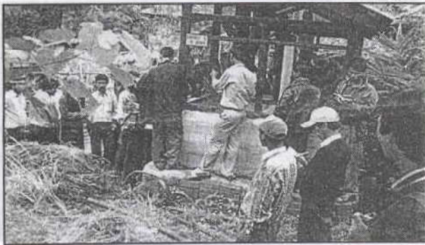
Watershed Committee members from West Khasi Hills District visit to Umrynjah Watershed (WDPSCA)