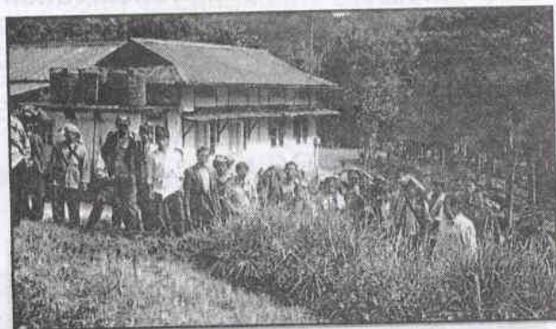
Farmers from Khadar Shnong Watershed (WDPSCA), East Khasi Hills attending training session at ICAR, Research Complex.

The Shillong Territorial Soil Conservation Division organized a one day Exposure trip-cum Training as part of skill upgradation for the farming community of Khadar Shnong Watershed (WDPSCA) to ICAR, Umroi, Ri-Bhoi. Altogether 51 (Fifty One) farmers from 8 (Eight) villages of Khadar Shnong attended the programme. The farmers were exposed to different farming units/systems/like Agro-Forestry systems including vermi compost, improved agricultural implements and Machineries, Horticultural System, Piggery and Rabbitries in the animal production farm.