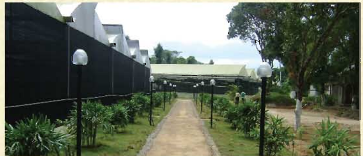
Horticulture – future of Garo Hills