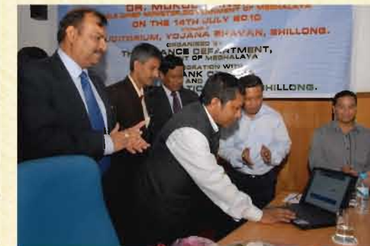
Meghalaya CM, Dr Mukul Sangma launching the Online System of Tax Receipt via Cyber Treasury at the Yojana Bhavan Auditorium, Shillong on 14.7.10