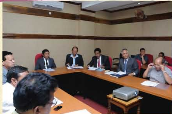
Meghalaya Chief Minister, Dr. Mukul Sangma attending the Border Area meeting at the Committee Room, Yojana Bhavan, Shillong on July 15, 2010