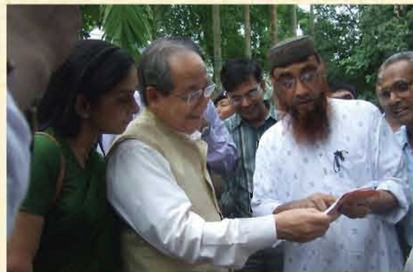
The Governor of Meghalaya Mr. Ranjit Shekhar Mooshahary visiting the Tomb of Mir Jumla, West Garo Hills on August 6, 2010