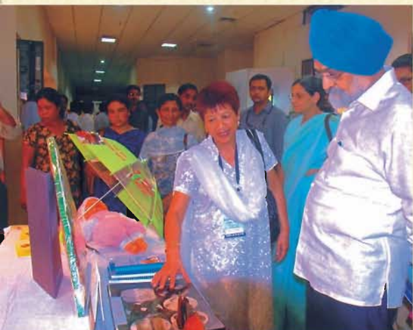
Dr. Montek Singh Ahluwalia, Deputy Chairman Planning Commission at the Display Material (Meghalaya) Pre Retreat Poster Exhibition on Innovative Approaches at New Delhi.

The Retreat sought to evolve a Framework for a multisectoral National Plan of Action to prevent and reduce undernutrition – especially maternal and child undernutrition in India, in a time bound manner, with clearly articulated commitments of different stakeholders.