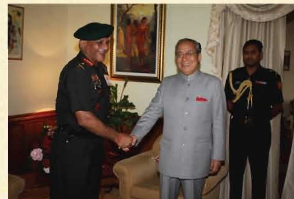
Shri. R. S. Mooshahary, Governor of Meghalaya with General V. K. Singh, Chief of Army Staff at Raj Bhavan, Shillong on 19.07.10