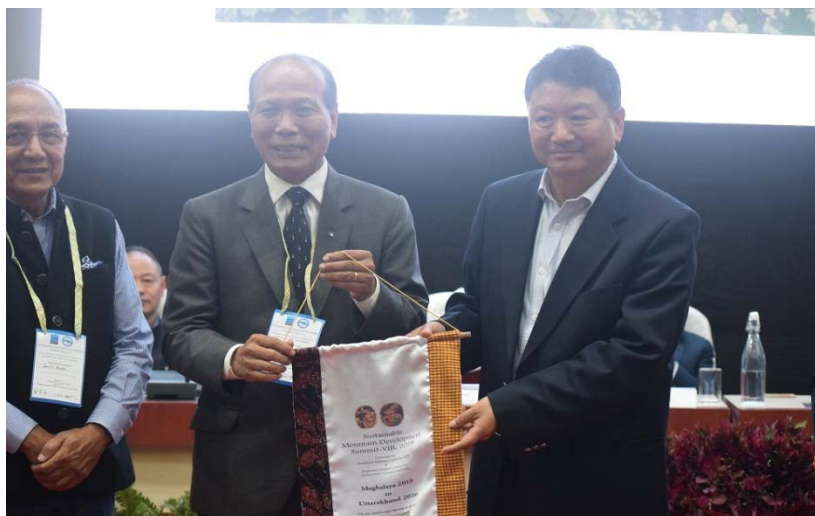
The baton being passed to Uttarakhand, host of the next edition of SMDS